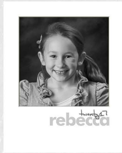
8x10 Gallery Mat