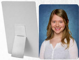
4x6 Metal Desk Print w/ Easel Back